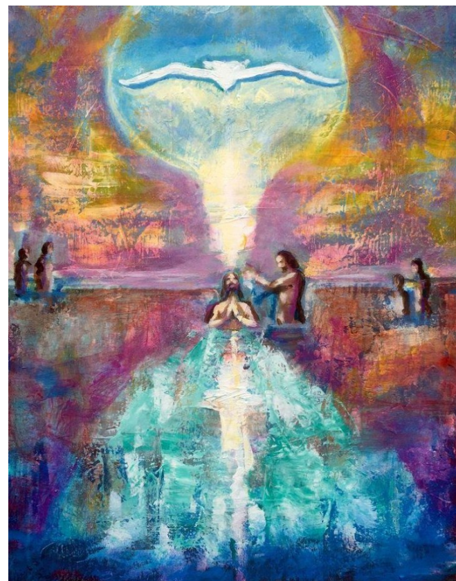
"The Baptism of Christ" by Pavol Olavsky III

2600 Richmond Road SW., Calgary, AB T3E 4M3 info@calgaryfirstmennonite.ca | 403-249-8784 Pastor: Caleb Kowalko | pastor@calgaryfirstmennonite.ca