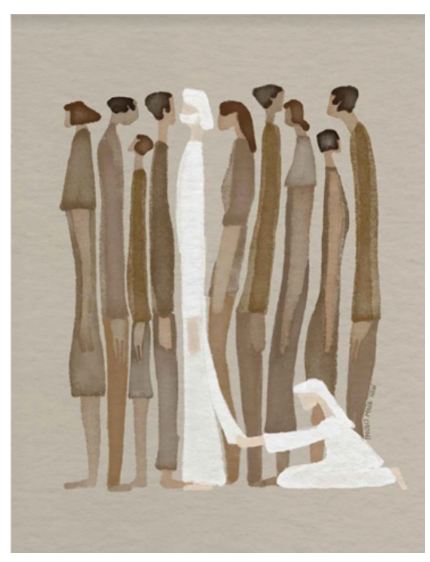
"Woman Touches Jesus" by Adora

2600 Richmond Road SW, Calgary, AB T3E 4M3 Phone: 403-249-8784 Email: info@calgaryfirstmennonite.ca