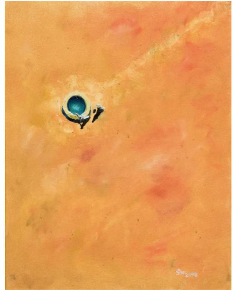
"Jesus and the Woman at the Well" - Neil Thorogood

2600 RICHMOND ROAD SW, CALGARY, AB T3E 4M3